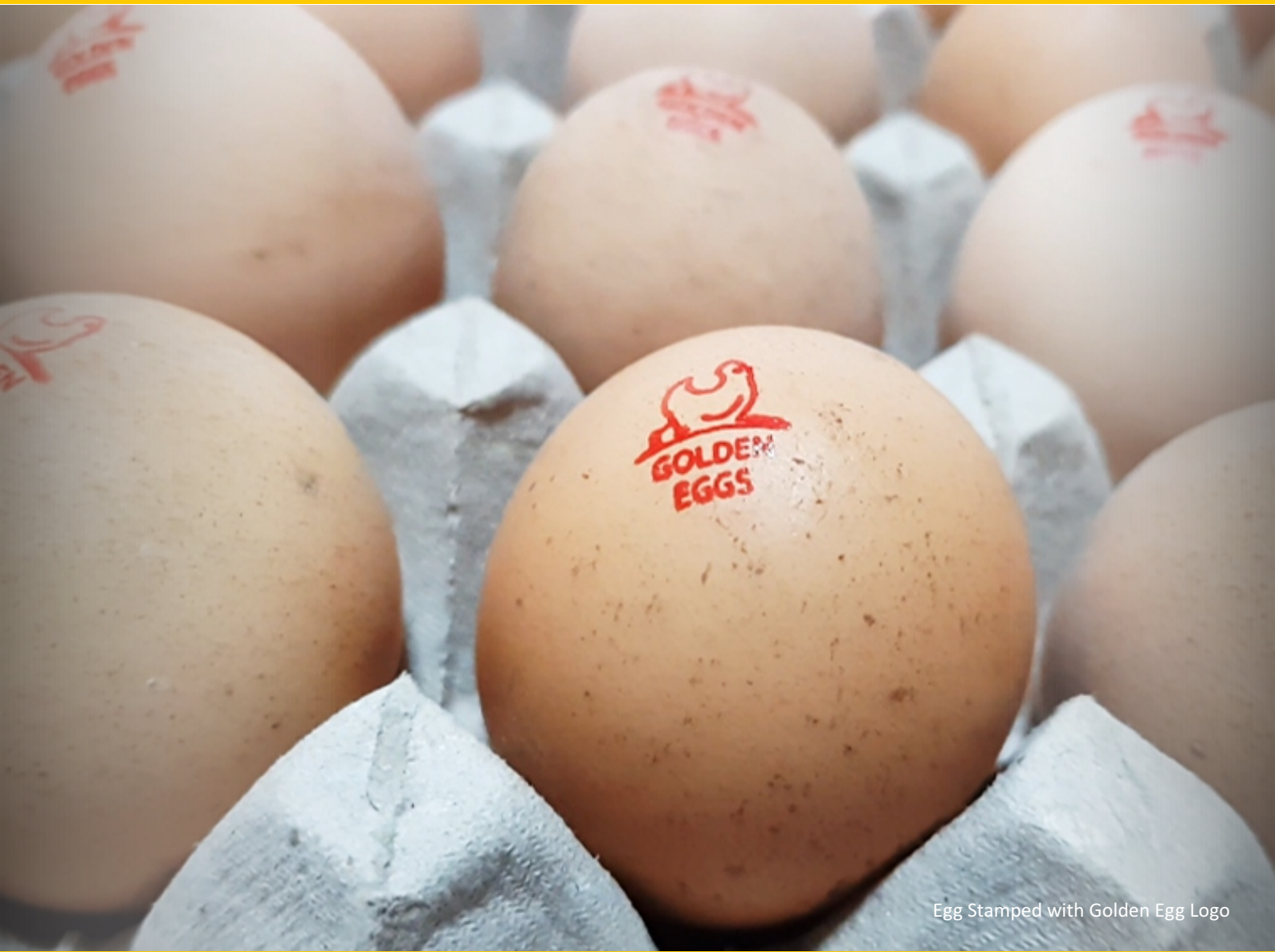
Egg Stamped with Golden Egg Logo