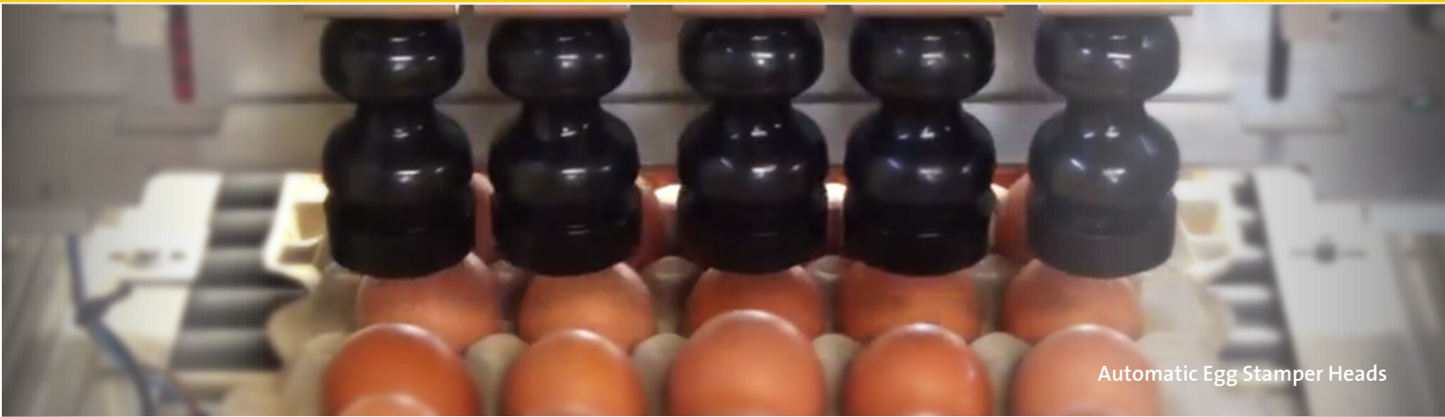
Automatic Egg Stamper Heads